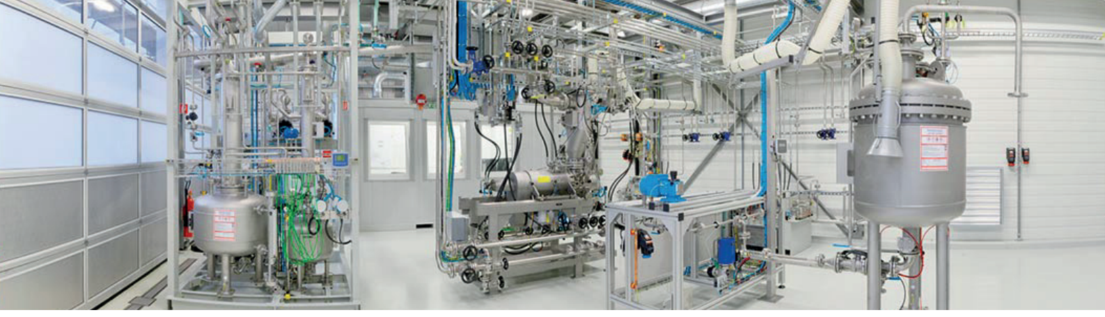
Bay One at our Test-Centre: available for full-stack customization.